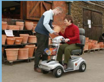
Shopping indoors and out is hassle free with the 388's compact design (388D shown)

For further details on the extensive Rascal range call: freephone 0800 252614