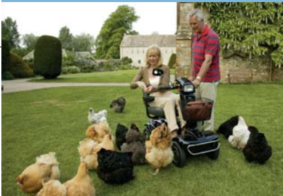
Enjoy day trips in comfort and style with your Rascal (388XL shown)

With three models to choose from, you can own the ideal scooter for your needs. All are designed with a narrow, compact chassis for ease of manoeuvring whether you are close to home, or out on a day trip, and include a fully adjustable swivel seat. The cost effective 388S offers an ideal 4mph entry level model while the 388D combines an upgraded seat and lift-up tiller head for easy access. If you want a little more speed, the Class III 388XL has a 6mph top speed and stylish 11" wheels. Relax...it's a Rascal.